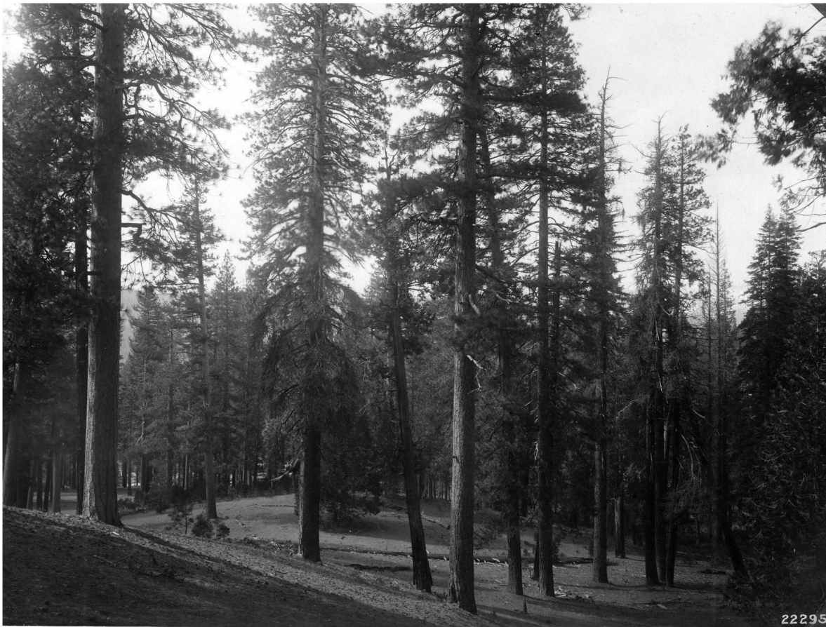
Fig. 1. Mixed conifer forest from Chiquito Basin on the Sierra National Forest. Photo taken in 1914 by E. G. Dudley (USFS Bass Lake Ranger District historic photo archives; photo no. HP00971). Original caption read, “Typed-Sugar Pine killed by Dendroctonus monticolae , Chiquito Basin. Taken by Dudley, 1914.”

of time between the reconstruction period and data collection, as there is with most historical forest reconstructions in the western US (>100 years), uncertainty increases owing to sample losses from fire, insects, disease, and decomposition (Collins et al. 2011).