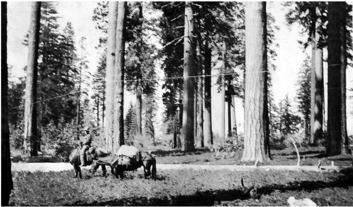
Fig. 2. Historic conditions in a ponderosa pine stand on the Sierra National Forest (ca. 1917; Sierra National Forest Photo HP03137).